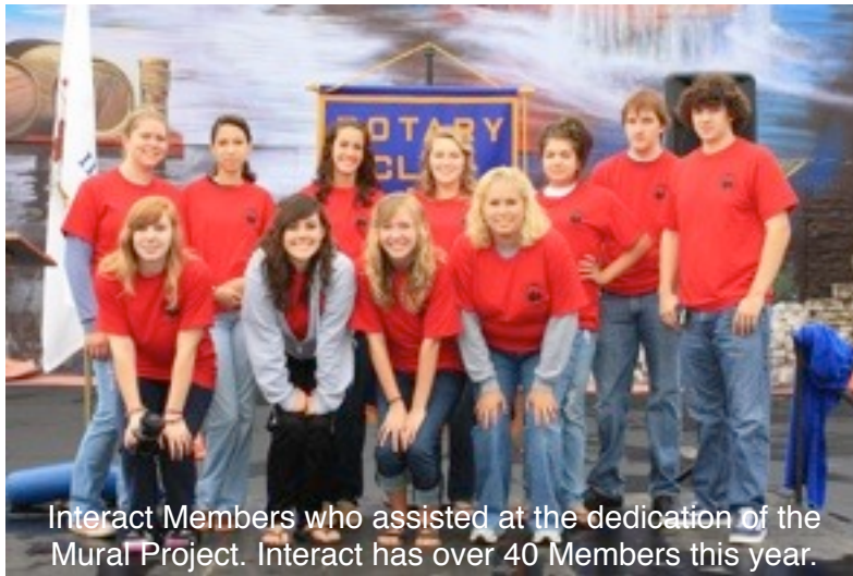
Interact Members who assisted at the dedication of the Mural Project. Interact has over 40 Members this year.