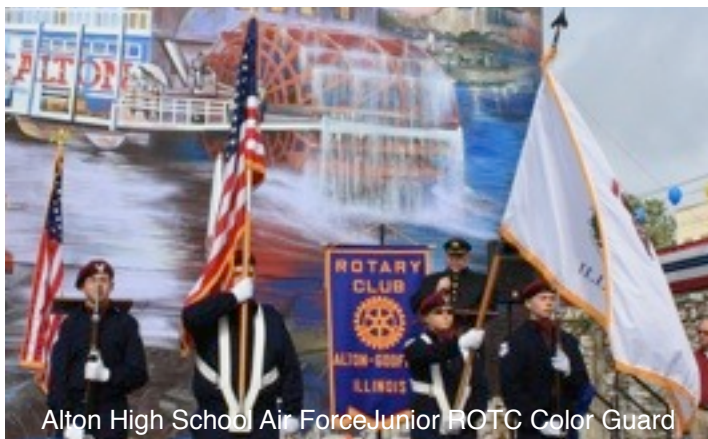
Alton High School Air Force Junior ROTC Color Guard