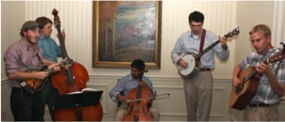
Entertainment by The Red Barn