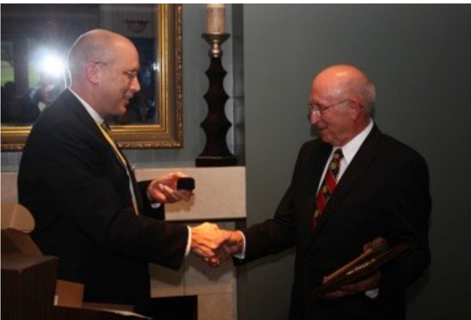
The passing of the torch