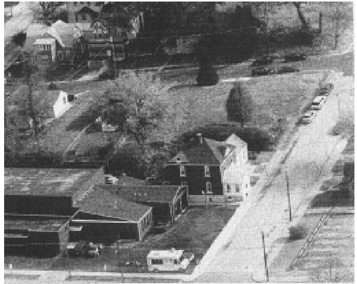
Booth House Site with Alby along the bottom of the photo and 5th Street going up to Easton.

Planning is already underway on this project. Shepard, Morgan & Schwab will prepare a site survey and architectural plans will be prepared for a 42 bed two story brick building. This facility will contain a men's bathroom and shower, a women's bathroom and shower and bathtub, a staff bathroom, office space for the director and counseling staff, door security and video monitoring system, a small kitchenette with sink, disposal, refrigerator and microwave, living room with television, tables, and recreation area, and an elevator.